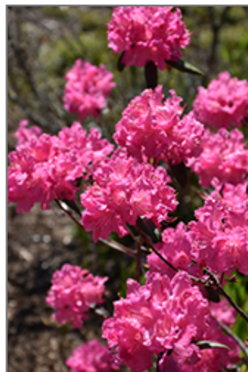
Landmark Rhododendron flowers