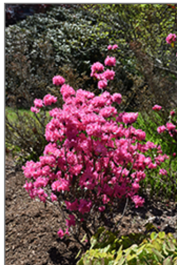
Landmark Rhododendron in bloom