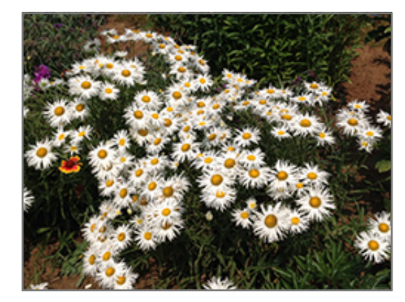
Crazy Daisy Shasta Daisy in bloom