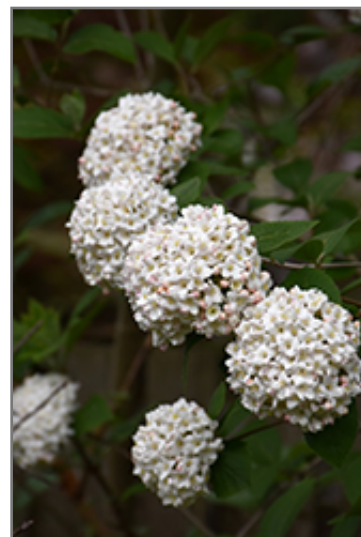
Fragrant Viburnum flowers

Fragrant Viburnum is recommended for the following landscape applications;