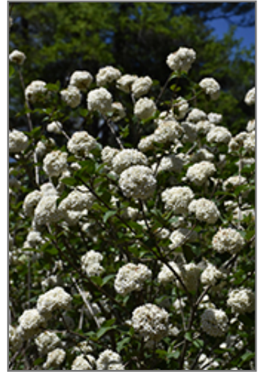
Fragrant Viburnum flowers

This shrub does best in full sun to partial shade. It prefers to grow in average to moist conditions, and shouldn't be allowed to dry out. It is not particular as to soil type or pH. It is highly tolerant of urban pollution and will even thrive in inner city environments. This particular variety is an interspecific hybrid.