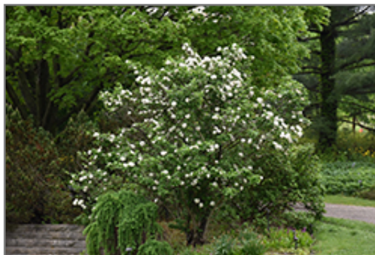
Fragrant Viburnum in bloom