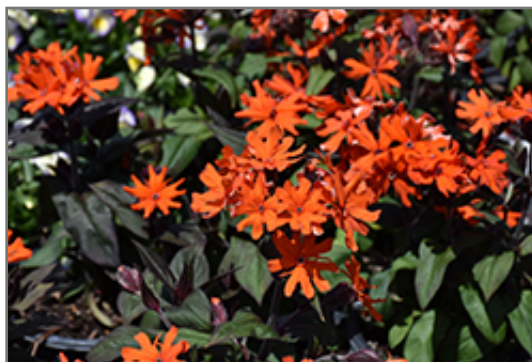
Orange Gnome Champion flowers