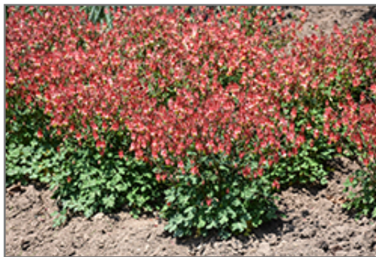
Little Lanterns Columbine in bloom