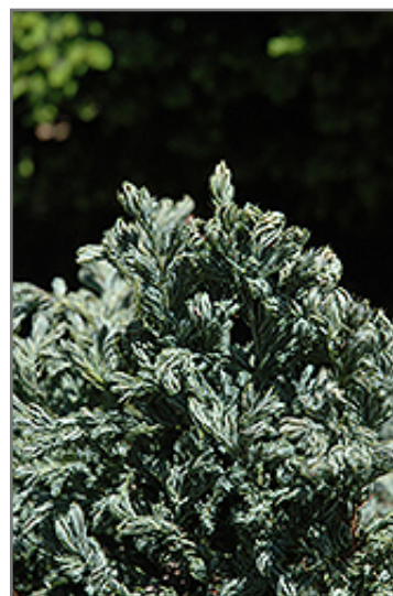
Curly Tops Moss Falsecypress foliage