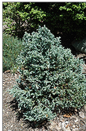
Curly Tops Moss Falsecypress

Curly Tops Moss Falsecypress is recommended for the following landscape applications;