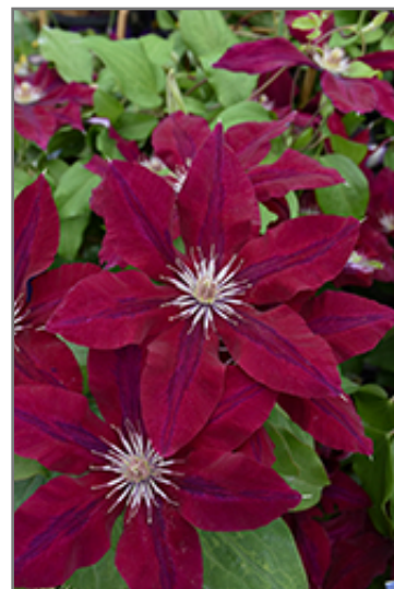
Rebecca Clematis flowers

Rebecca Clematis is recommended for the following landscape applications;