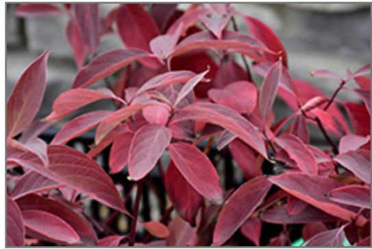
Arctic Fire Red Twig Dogwood in fall

This shrub does best in full sun to partial shade. It is an amazingly adaptable plant, tolerating both dry conditions and even some standing water. It is not particular as to soil type or pH. It is highly tolerant of urban pollution and will even thrive in inner city environments. This is a selection of a native North American species.