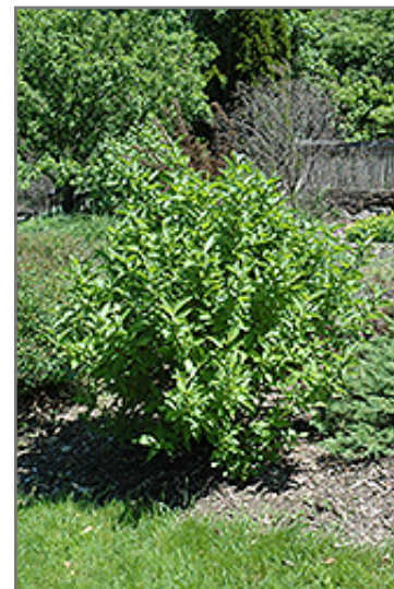
Arctic Fire Red Twig Dogwood