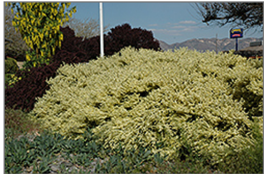
Moonlight Scotch Broom in bloom