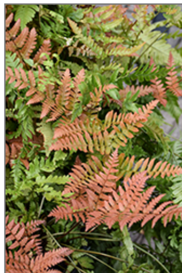
Brilliance Autumn Fern foliage