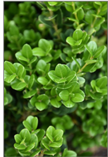
Wintergreen Boxwood foliage

Wintergreen Boxwood makes a fine choice for the outdoor landscape, but it is also well-suited for use in outdoor pots and containers. Because of its height, it is often used as a 'thriller' in the 'spiller-thriller-filler' container combination; plant it near the center of the pot, surrounded by smaller plants and those that spill over the edges. It is even sizeable enough that it can be grown alone in a suitable container. Note that when grown in a container, it may not perform exactly as indicated on the tag - this is to be expected. Also note that when growing plants in outdoor containers and baskets, they may require more frequent waterings than they would in the yard or garden.