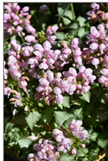
Pink Pewter Spotted Dead Nettle flowers

Pink Pewter Spotted Dead Nettle is recommended for the following landscape applications;