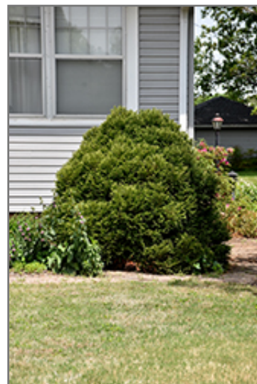
Dwarf Globe Japanese Cedar