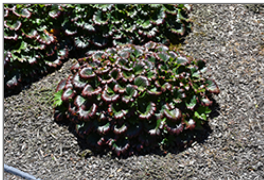
Crimson Fans Mukdenia