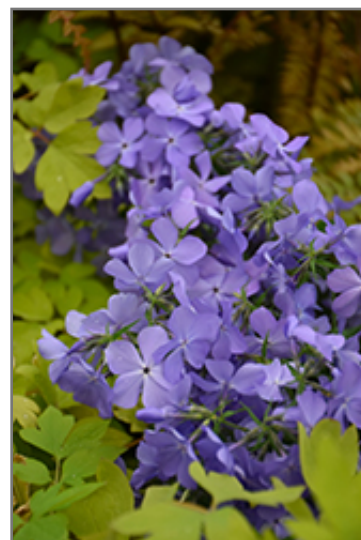
Blue Moon Phlox flowers