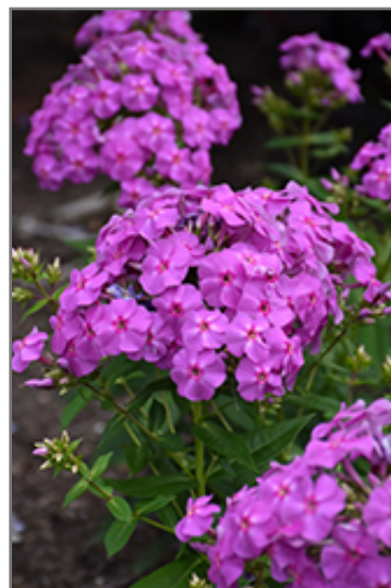
Flame Lilac Garden Phlox flowers

Flame Lilac Garden Phlox is recommended for the following landscape applications;