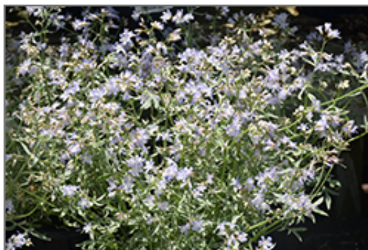
Touch Of Class Jacob's Ladder flowers