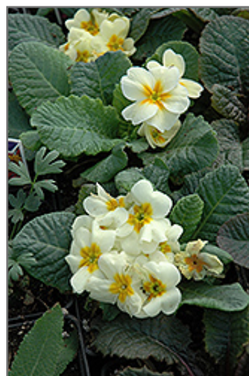
Wanda Primrose flowers

Wanda Primrose is recommended for the following landscape applications;