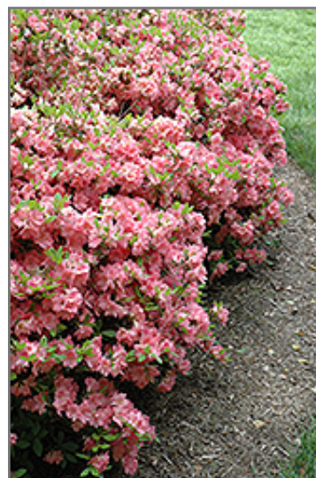
Blaauw's Pink Azalea in bloom