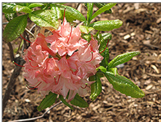
Cannon's Double Azalea flowers