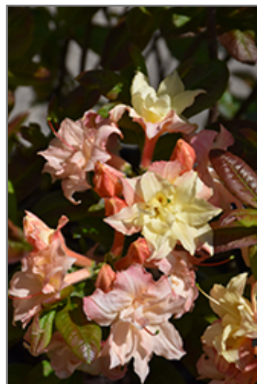
Cannon's Double Azalea flowers