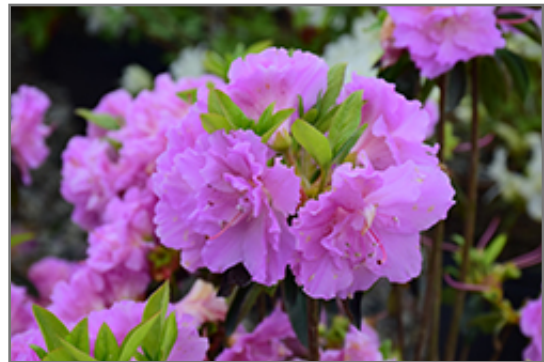
Elsie Lee Azalea flowers