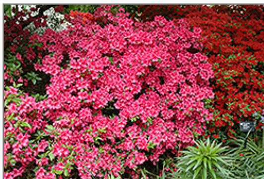
Girard's Rose Azalea in bloom