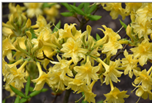
Narcissiflora Azalea flowers