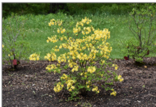
Narcissiflora Azalea in bloom