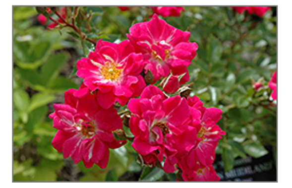
Crimson Meidiland Rose flowers

Visit our website at www.mahoneysgarden.com for the location nearest you!