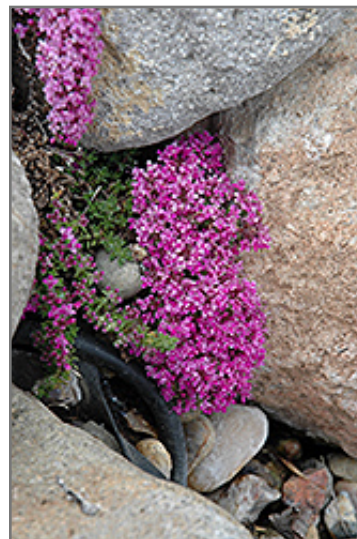
Pink Chintz Creeping Thyme in bloom