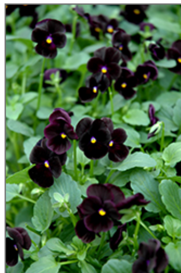
Sorbet Black Delight Pansy flowers