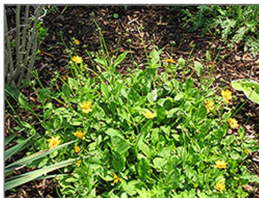
Sunshine Superman Tickseed in bloom