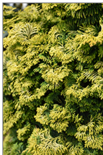
Dwarf Golden Hinoki Falsecypress foliage