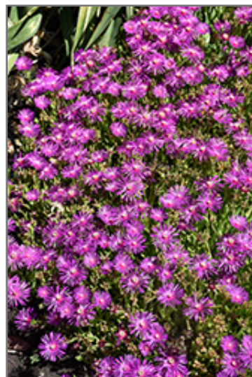
Purple Ice Plant flowers

Purple Ice Plant is recommended for the following landscape applications;