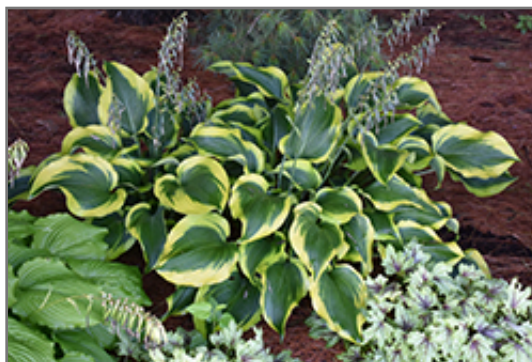
Atlantis Hosta

Atlantis Hosta is recommended for the following landscape applications;