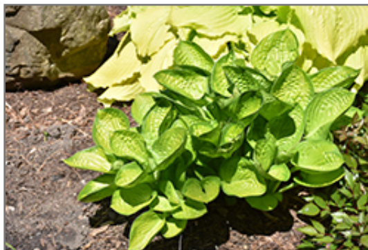
Rainforest Sunrise Hosta