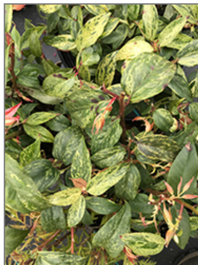
Rainbow Fetterbush foliage