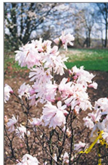
Centennial Magnolia flowers