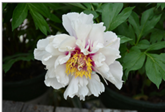
Cora Louise Peony flowers