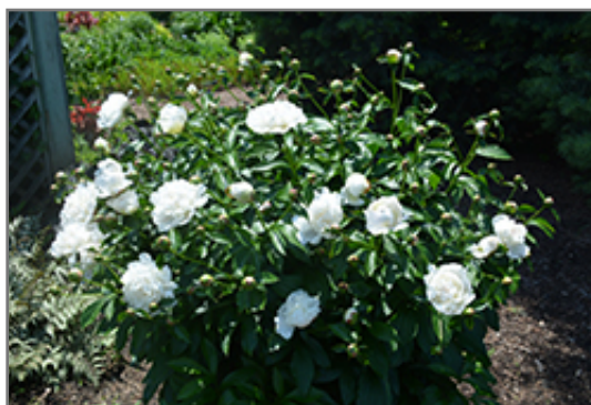
Festiva Maxima Peony in bloom