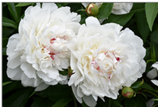
Festiva Maxima Peony flowers

Festiva Maxima Peony is recommended for the following landscape applications;