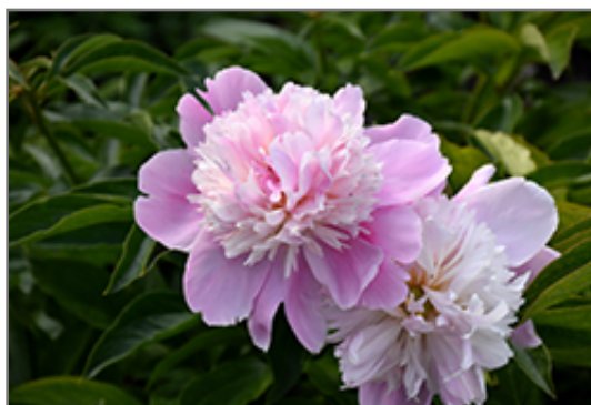
Monsieur Jules Elie Peony flowers