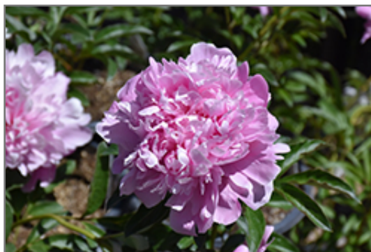
Monsieur Jules Elie Peony flowers