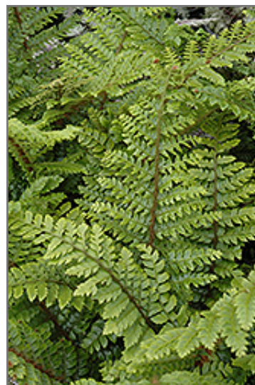
Japanese Tassel Fern foliage