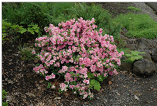
Gumpo Pink Azalea in bloom