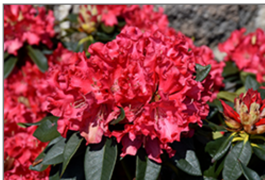
Jean Marie de Montague Rhododendron flowers