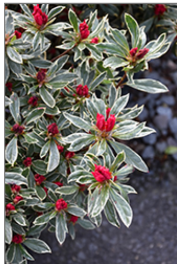
Silver Sword Azalea foliage