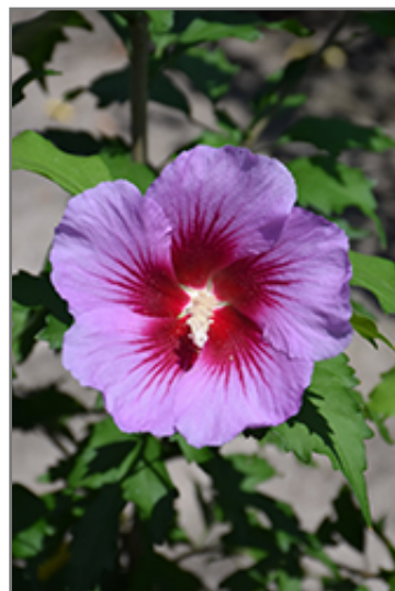
Purple Pillar Rose of Sharon flowers