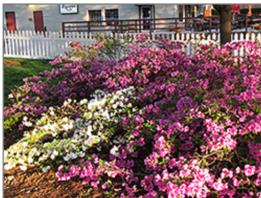
Purple Splendor Azalea in bloom